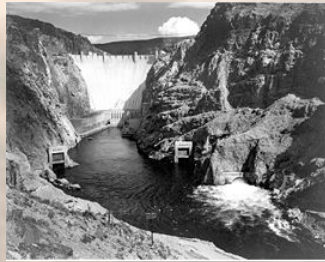
1:46 min clip